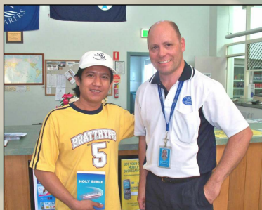
A Mission to Seafarers Chaplain presents a Bible to a merchant seaman in Australia.