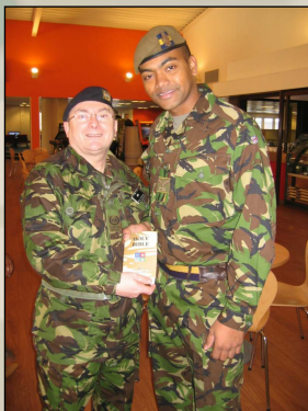
L/Cpl Johnson Beharry VC (right) receives a Bible to replace one he lost on the battlefield.